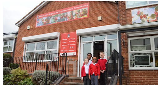
St Margaret Marys School